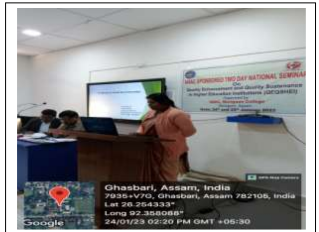
Paper presentation by Ajanta Sarkar